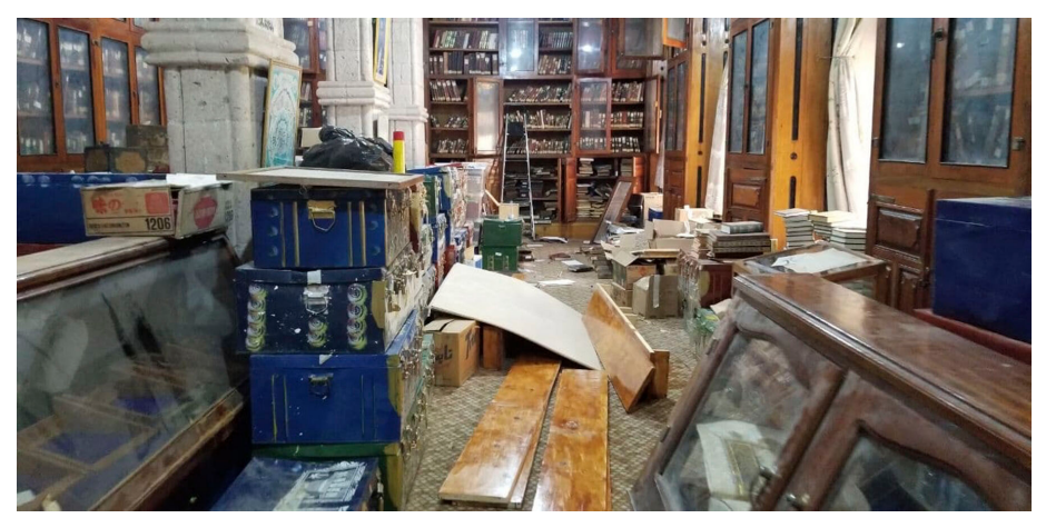
Figure 13.2 Inside the Maktabat al-Awqāf, 2009 (photo by Sabine Schmidtke)

Ms. Şan'ā', Maktabat al-Awqāf 2318, page 2, transfer note (upper two lines and margin) for the codex from Zafār to Sana'a in Rabī' I 1348 (August–September 1929) (photo by Sabine Schmidtke)